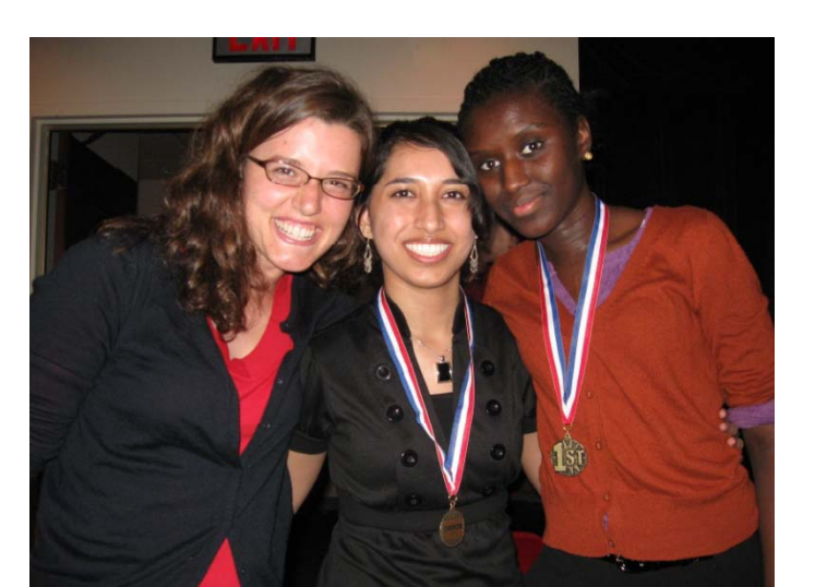
1 st Place: NYC SEF