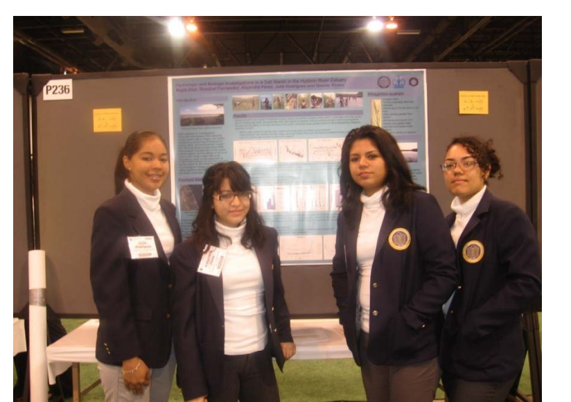
SSFRP Students at GSA